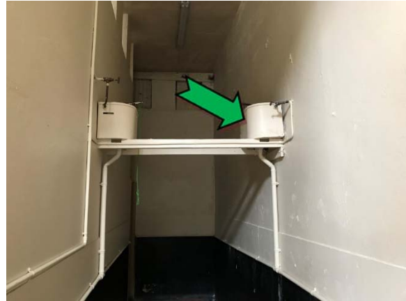
Photo 2. Interior, men's toilet, cistern – non asbestos-containing moulded fibre cement.