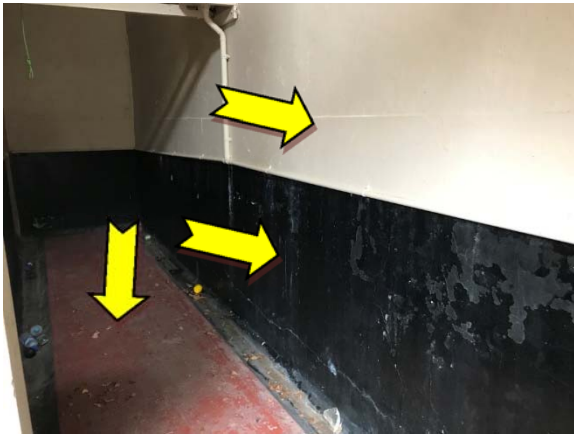
Photo 3. Interior, throughout, walls and floor – suspected lead-containing cream, black and red upper coloured paint systems.