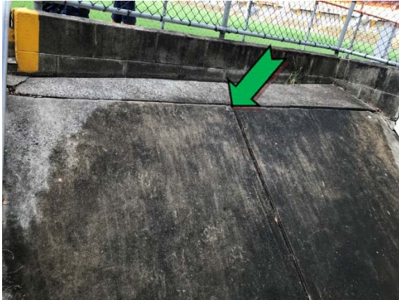
Photo 1. Exterior, floor, expansion joint – non asbestos-containing construction joint mastic.